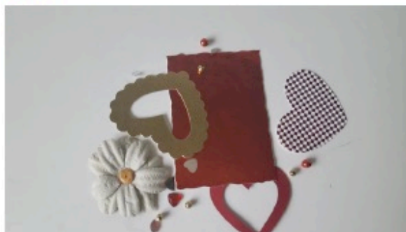
Example of personal items