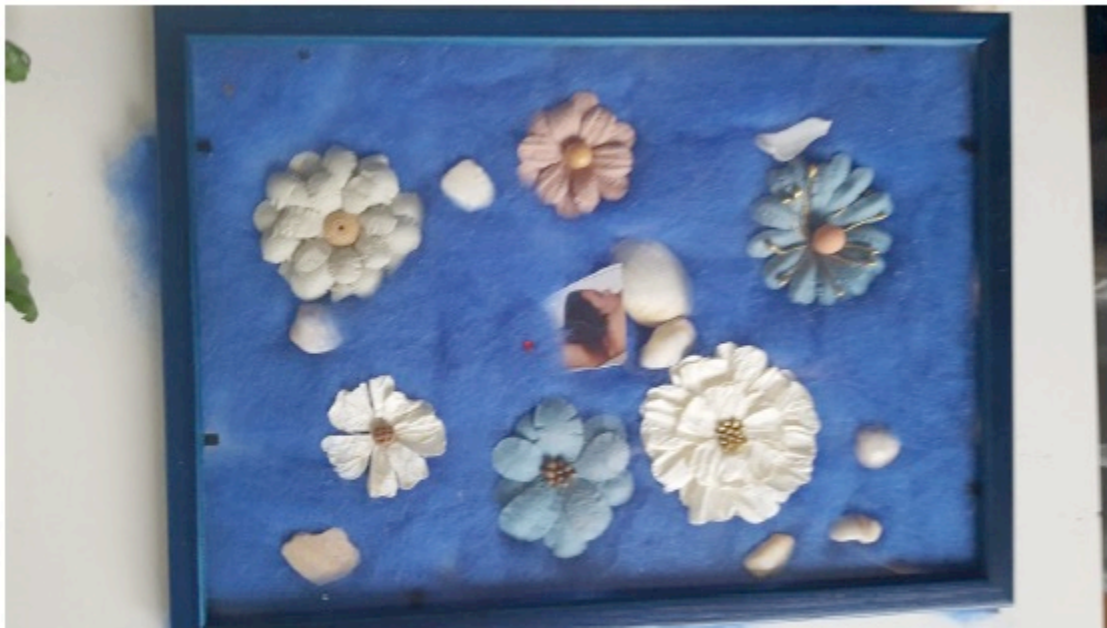
Stage three: Transformation (putting wool, finding place for cut out piece, using personal items)