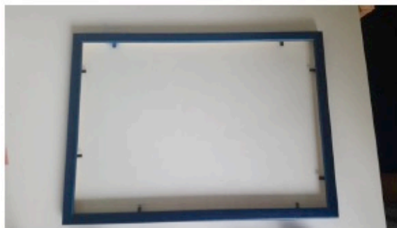
Photo frame with glass