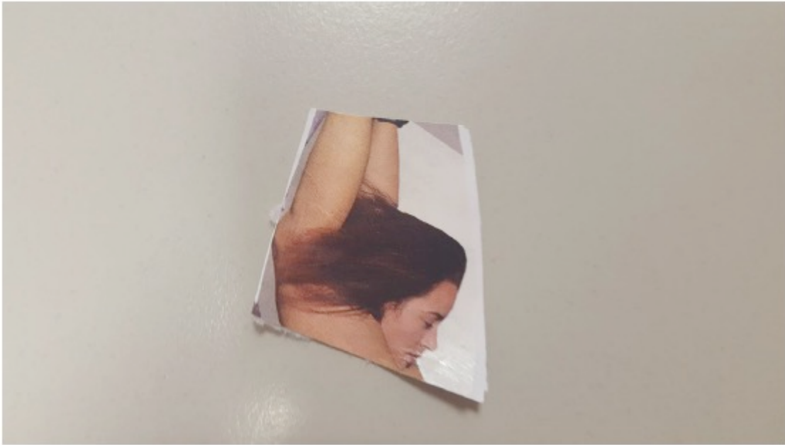
Stage three: Transformation (cut out piece from the collage)